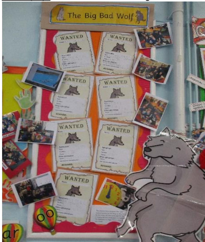
Where has the third little piggy gone? Mr Wolf has told us he is on holiday at Piggy Island in the Bahamas ... he even has photos! What do you think?

Children's work is celebrated and displayed throughout the environment and in children's individual 'Learning Journeys'. These are shared with the children and with parents during curriculum mornings and parent consultation afternoons. Parents contribute to their children's 'Learning Journeys' by sending in 'Wow' cards to celebrate successes at home.