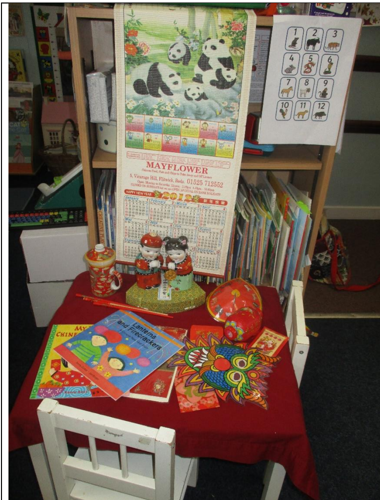
Interactive activity tables – Chinese New Year artifacts